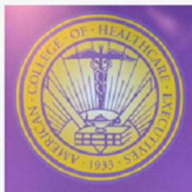
Congress 2022 Highlights HLNDV members